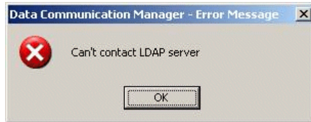
Figure 4: Error Message—LDAP Server is Not Accessible

To correct this error, do the following: