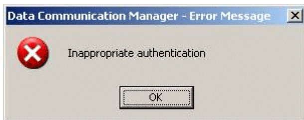
Figure 2: Error Message—Blank Password

To correct this error, log on to your GUI application with a valid non-empty password.